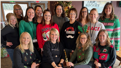
SHNFP team members celebrating the holidays with holiday attire, cookies & a fun-filled team meeting