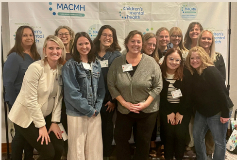
SHNFP team attending the Infant & Early Childhood Multidisciplinary Conference in Brooklyn Park, MN in November 2024